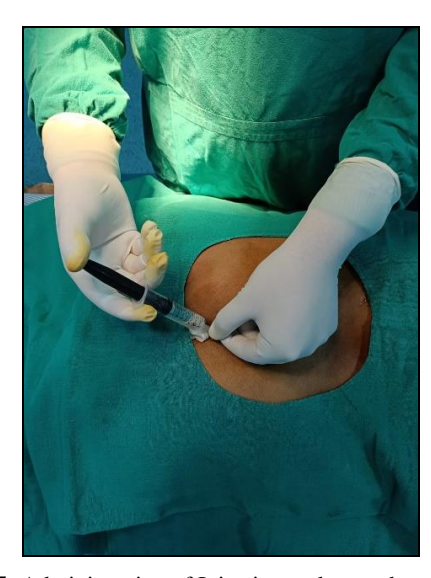
Fig 5: Administration of Injection and procedure photo