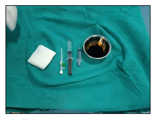
Fig 2: Materials Used During Procedure