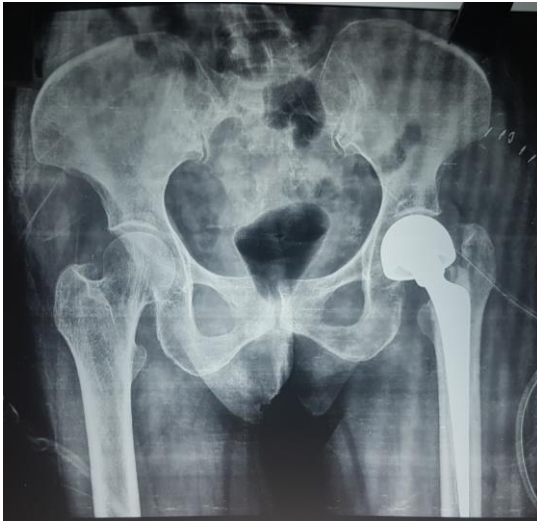
Fig: 1 and 2

Pre operative and Post operative X ray of patient with subcapital fracture neck of femur, operated with cemented modular bipolar hemiarthroplasty. This patient had shortening less than 1cm.