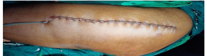
Fig 4: Closer Image

After the completion of the fixation, a thorough wash of the wound was given with normal saline. A suction drain was inserted at the entry point and wound closed in layers. Sterile dressing was applied, and the compression bandage used