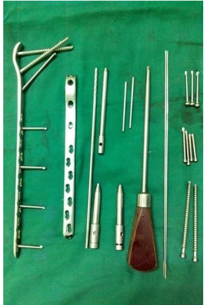
Fig 1: The implants used were proximal femoral locking plate and screws