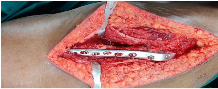
Fig 2. Intraop image

Under C-arm guidance, three guide pins passed into the femoral neck at 95 degrees, 120 degrees and 135 degrees. After drilling, proximal fragment fixed with three 6.5 mm fully threaded cancellous screws and remaining distal holes fixed with 5mm cortical screws. Fracture reduction and position of screws confirmed under C-arm.