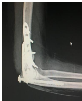
Immediate Post op x-ray images