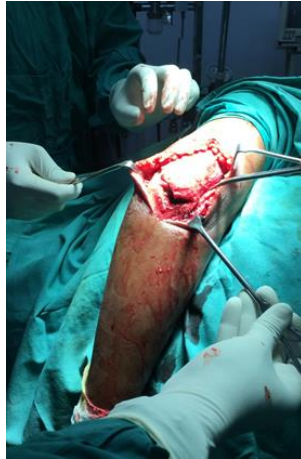
Ulnar Nerve Isolation