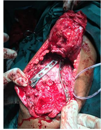
Fracture fixed with Dual Plate