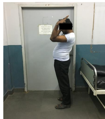
Clinical Photograph - Final range of motion at 6 months