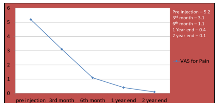
Fig 1: VAS for pain

We have M: F ratio 1.55:1. In our study, we have 60 patients injured on dominant side and 27 on the non- dominant side. The difference between Preinjection and Postinjection VAS scores was extremely statistically significant ( P < 0.001 ).