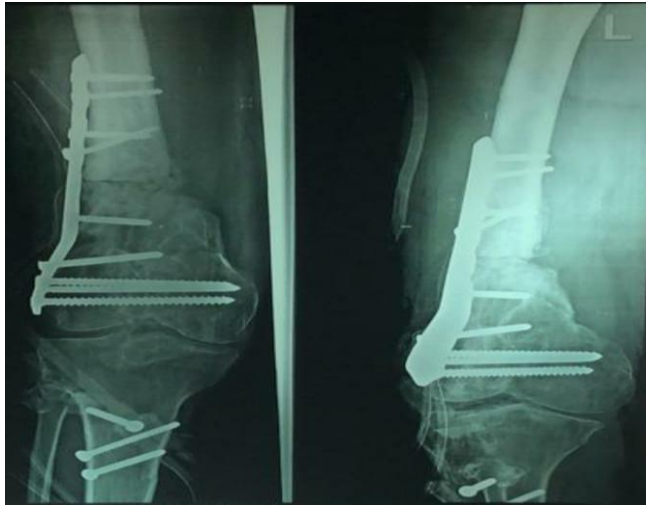
Fig 2: Synthetic Bone Graft