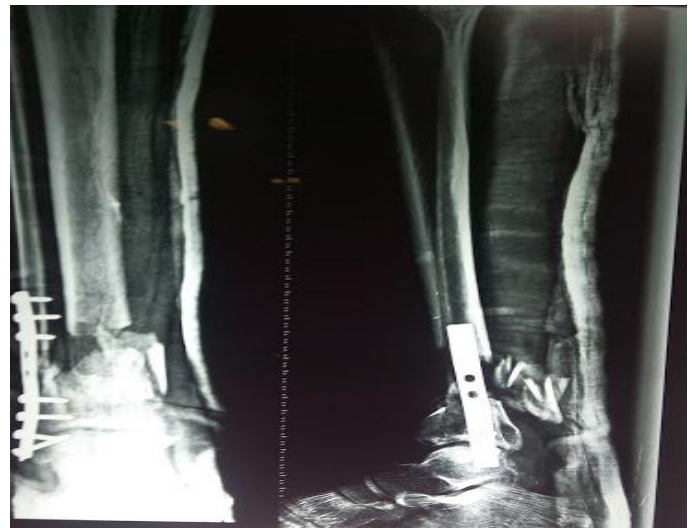
Fig 1: Autologous Bone Graft

SD_1 , SD_2 are standard deviation in group 1 and group 2.