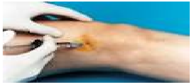
Performing injection with prefilled syringe of hyaluronic acid through superolateral angle of patella as the site of injection.

The mean VAS score was 7.45 pre procedure and at one week follow up it was 5.27, At 2 nd week it was 4.24 and at 3 rd week it was 3.21. At 3 rd months it was significantly lower than preprocedure score and was 1.59. It was still lower at 6 month but was slightly more than 3 rd month and it was 1.64. There is gradual improvement in patient's condition as VAS Score decreases from 7.5 to 1.59 at 3 rd month follow up. Although the VAS Score increases slightly from 3 rd to 6 th month (1.64) but the condition of patient was significantly better. At 1 st week follow up 9(24.3%) patients had significant pain relief, 12(33%) at 2 weeks follow up, 19(51%) at 3 weeks, 32(86.4%) at 3 months and 35(94.5%) at 6 months follow up shows significant pain relief respectively.