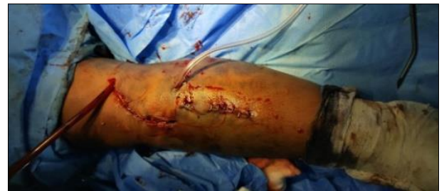
Fig 1: Active surgical drain

The choice of side of plate insertion, medial or lateral, was based on fracture type and location as well as on soft tissue condition. After fracture fixation was completed and final radiological evaluation of all components of fixation performed, the wounds were closed. Intravenous antibiotics were given in all cases for 3 days followed by orals after surgery.