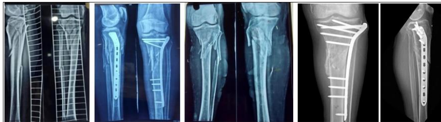
Fig 2: Some pre and post-operative radiographs