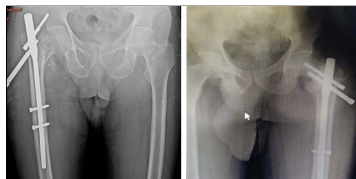
Fig 5 and 6: Z effect