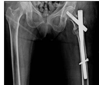
Fig 2: Protruding nail