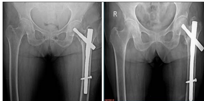
Fig 3 and 4: Screw back out in PFNA II