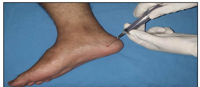
Fig 3: Technique of injecting PRP