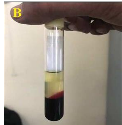
Fig 2: Three layers of RBC, buffy coat with platelets, and PPP