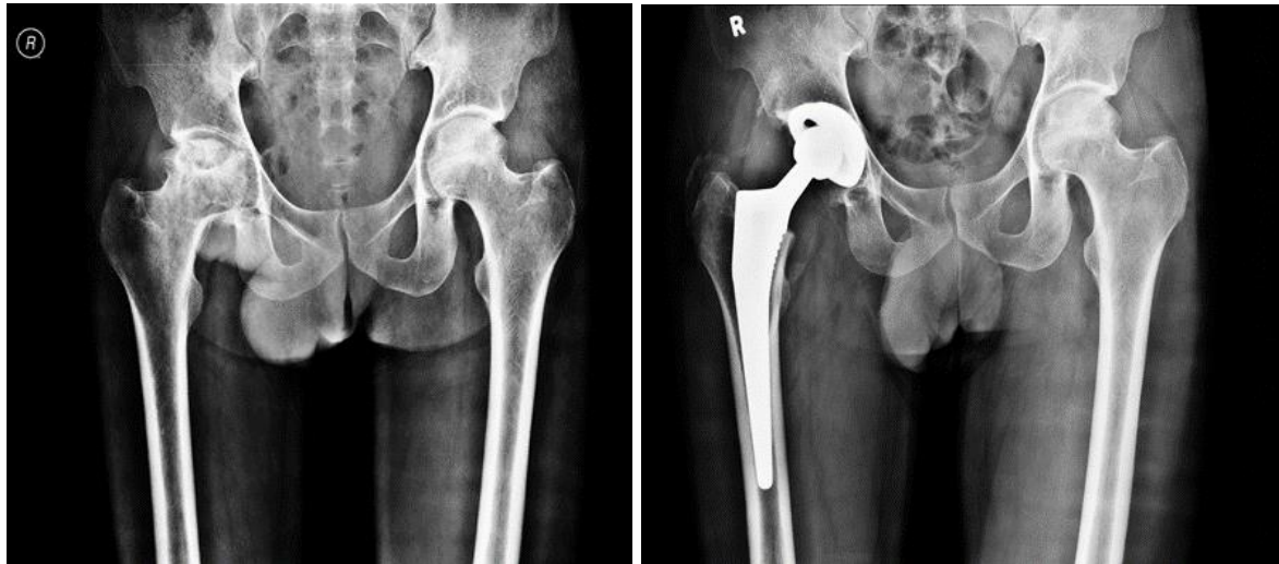
Fig 2: Pre op and post op x-ray