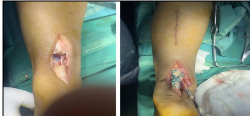
Fig 4: Two incision and VY plasty and FHL transfer.