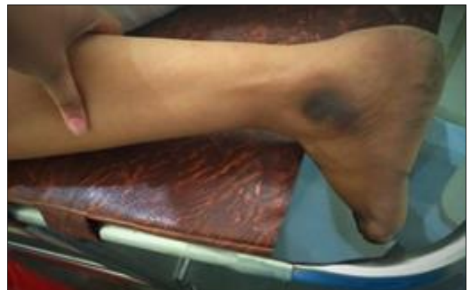
Fig 1: Simmonds-Thompson test

None of the patients had history of any regional steroid intake or any quinolones (other drugs) administration. There was no any wound dehiscence or delayed healing. There was no coexistence of any other tendon rupture with this condition.