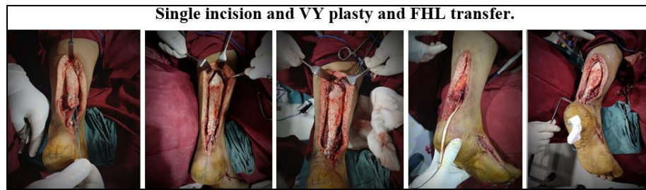
Fig 3: steps of the surgery for TA debridement, V-Y plasty and FHL transfer.